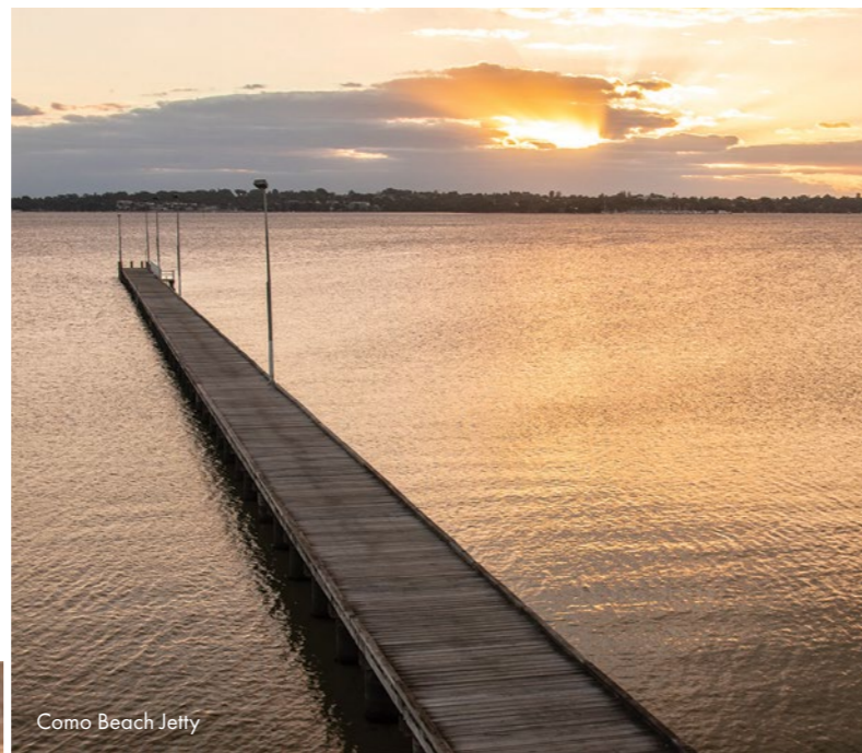
Como Beach Jetty

Boasting a riverside location just minutes from Perth's CBD, Como delivers the ultimate blend of energy and relaxation. Experience an eclectic array of dining, retail, and entertainment at your doorstep with the Crown Entertainment Complex, Optus Stadium, Perth Convention & Exhibition Centre, and RAC Arena less than 7kms away.