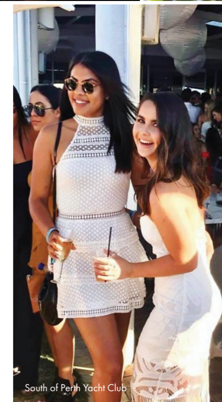
South of Perth Yacht Club